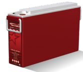
NSB 190FT HT RED