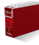
NSB 100FT HT RED