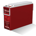
NSB 92FT HT RED