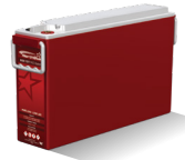
NSB 170FT HT RED